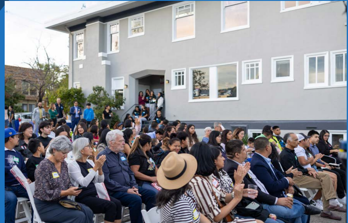
We are proud that our Scholar House is a place of comfort for so many students and families.

"I feel great having my children in the program," she says. "I know they will prosper."